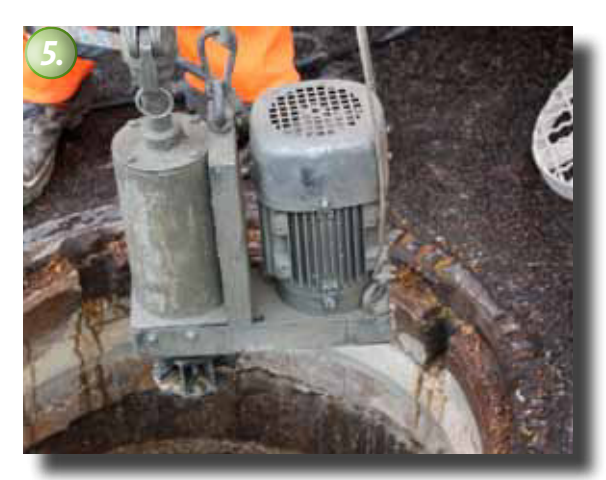
5. The material is mixed inside a mortar pump and then pumped into a special application tool. This tool is a rotating spiral, which literally shoots the material onto the...