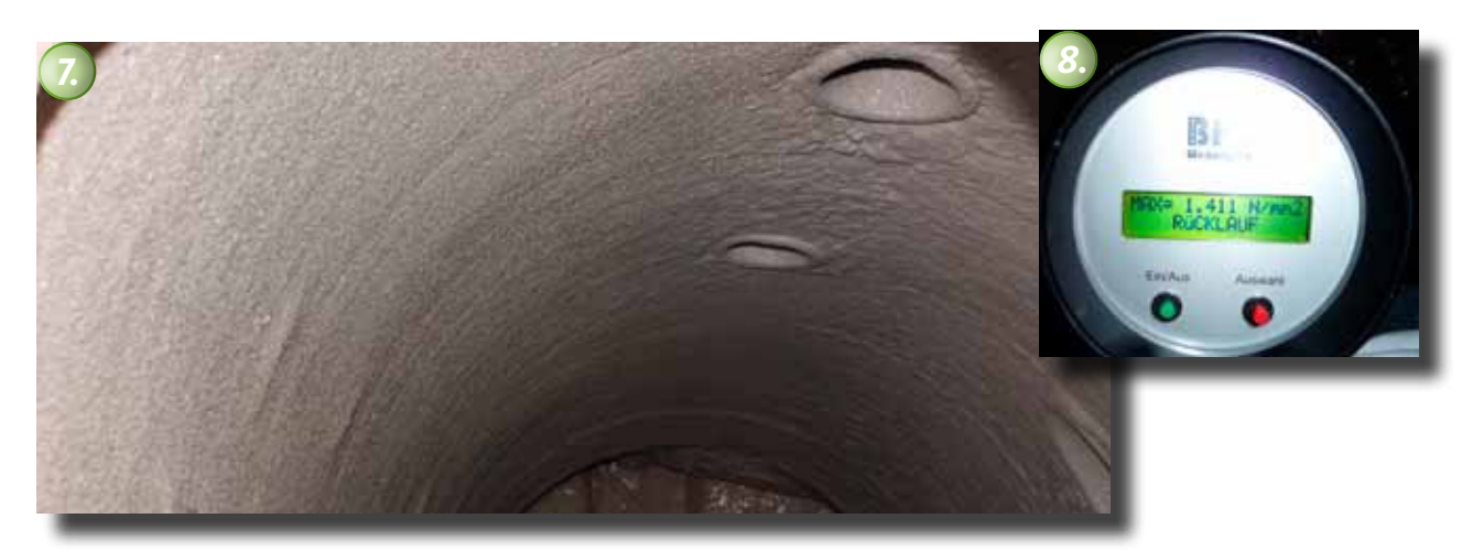
7. The ready coated shaft. A comparably smooth and homogeneous surface is achieved.