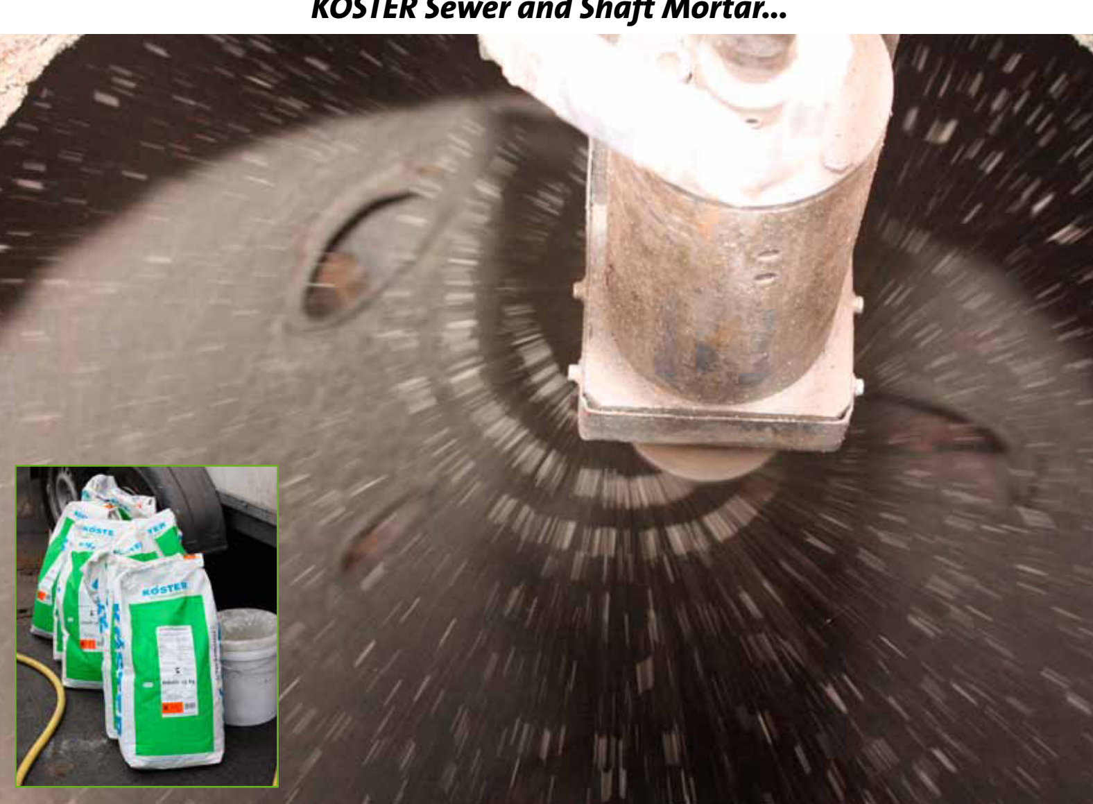
... during a successful test application with a special spraying machine for shafts.